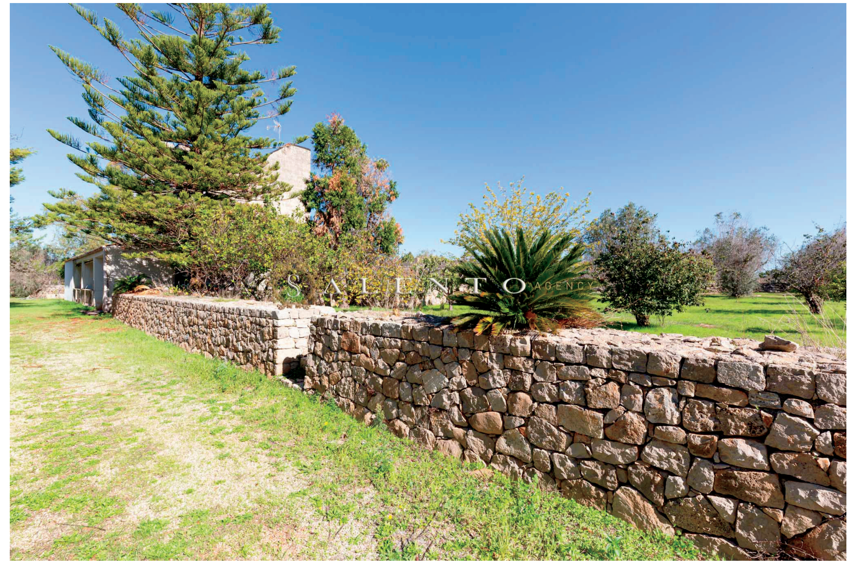
Dry stone wall surrounding the property